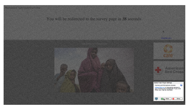
Figure 5: Cursor-spoofing attack with lightbox defenses. The intensity of each pixel outside of the target element is darkened and randomized when the actual pointer hovers on the target element.

Attack. Participants in Group 3 were exposed to the simulated cursor spoofing attack, with no defenses to protect them. The attack succeeded against 31 of 72 participants (43%). The difference in the attack success rates between participants assigned to the non-persuasion control treat-