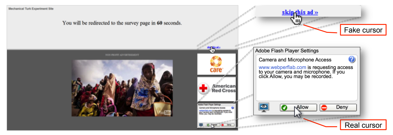
Figure 1: Cursor spoofing attack page. The target Flash Player webcam settings dialog is at the bottom right of the page, with a "skip this ad" bait link remotely above it. Note there are two cursors displayed on the page: a fake cursor is drawn over the "skip this ad" link while the actual pointer hovers over the webcam access "Allow" button.

tegrity and did not evaluate various design parameters. In this work, we comprehensively address these issues, and we also establish the taxonomy of context integrity explicitly.