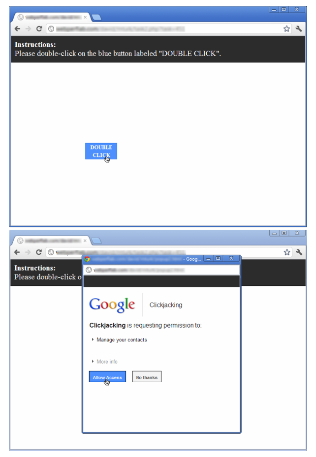
Figure 2: Double-click attack page. The target OAuth dialog popup window appears underneath the pointer immediately after the first click on the decoy button.

second click (the second half of the double-click). This attack can steal a user's emails and other private data from the user's Google account.